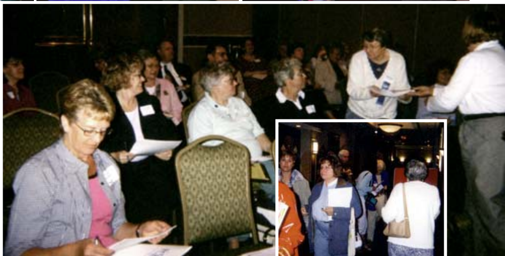
Right: Attendees at the 2004 Friends Institute.